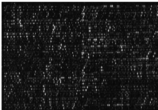
Figure 3. Example of the GeneChip-microarray, ready for analysis.

ray. Multiple probe arrays are synthesised simultaneously on a large glass wafer. This parallel process enhances reproducibility and helps achieve economies of scale [1].