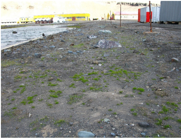
Fig. 2 Poa annua in the vicinity of Arctowski Station

assumed seed rain and our interpretation of results might have been biased. The selected scheme potentially allowed to minimize the interference of seed rain of plants growing in the vicinity. At each sampling point we collected 100 cm 3 of soil from the 0–5 cm layer. We collected 80 soil samples amounting to 8 liters and 0.157 m 2 soil surface area. The collected samples were air dried at room temperature at the Station and transported to our laboratory in Poland at 4 °C.